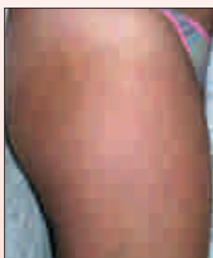
After two INTRAcel treatments