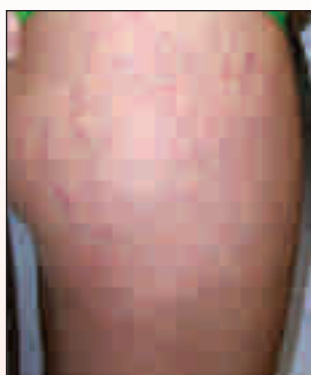
Stretch marks before Tx

Whenever using the bipolar and monopolar modes together, you get a balance between short- and long-term effects, according to Dr. Downie. "The bipolar RF